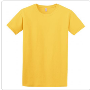
DAISY SOFT STYLE T-SHIRT