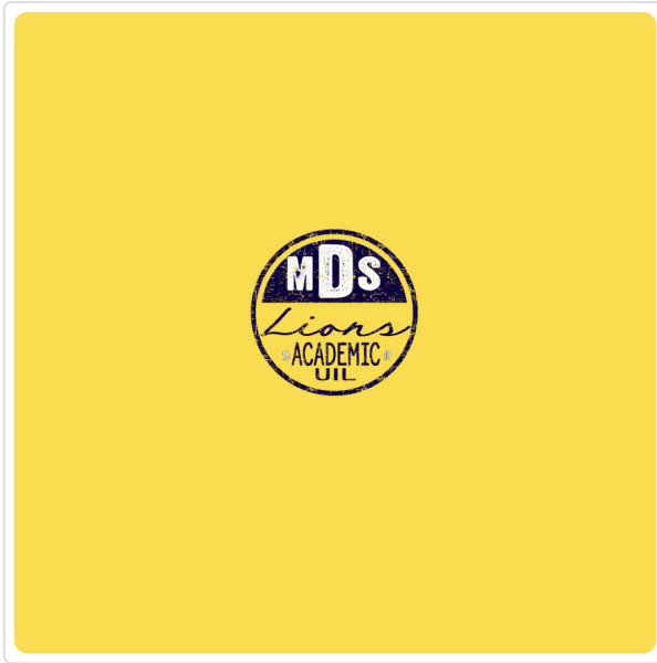
FRONT CHEST LEFT

RETURN THIS FORM TO Mrs. Branch F101 BY January 25th Orders will be delivered to you individually upon arrival.